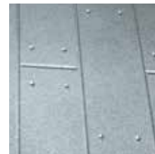
wooden planks optics