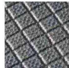
rhombic profile with top coat