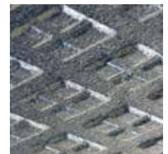
multisquare profile on lower side

* can be driven on with standard equipment such as farm yard loader or tractor with authorized pneumatic tyres at the recommended inflation pressure up to max. 4 bar. (Notice: drive with due care and steer in large radius!)